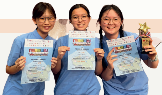
1ST GBA-HK-MACAU THE "KIDS VOICE" CUP SPEECH & STORY TELLING COMPETITION