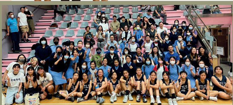
HKSSF KOWLOON DISTRICT BASKETBALL DIVISION I COMPETITION 1ST RUNNER UP