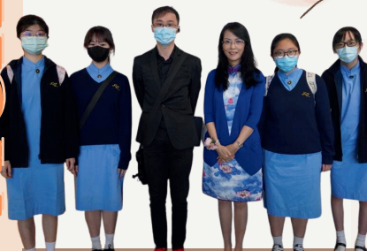
"VIRTUAL TOUR OF ANCIENT AND MODERN CHINA" DESIGN COMPETITION