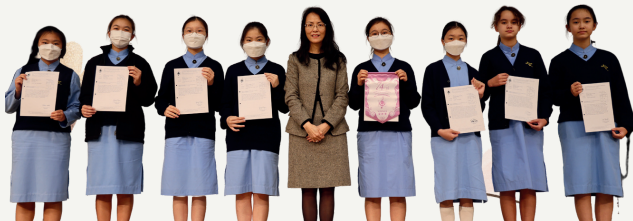
HONG KONG SPEECH FESTIVAL MEDALISTS