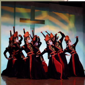
INTER-SCHOOL DANCE FESTIVAL