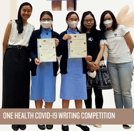
ONE HEALTH COVID-19 WRITING COMPETITION