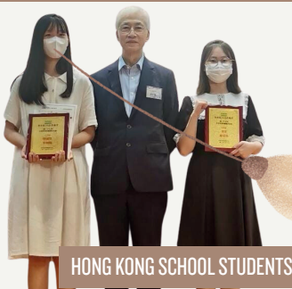
HONG KONG SCHOOL STUDENTS' COUPLETS COMPETITION

Their brilliance knows no boundaries as they showcase their talents in a multitude of disciplines. From mastering the intricacies of AI and computer programming to wielding the power of language with eloquence and finesse, their talents leave incredible marks in the history of KTL. But wait, there's more! Their minds are filled with innovative ideas, and they fearlessly bring them to life at a level that compares to professionals. Their tireless pursuit of excellence has earned them not only trophies but also coveted scholarships that recognize their exceptional effort.