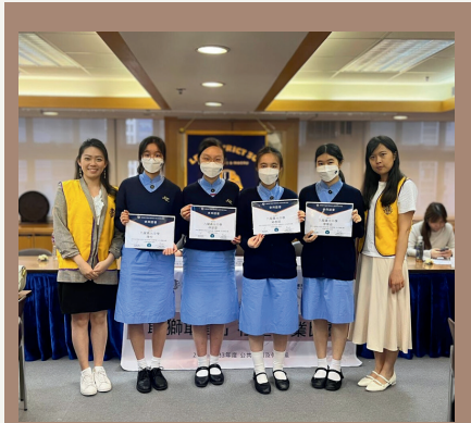
SOCIAL ENTERPRISE PROPOSAL COMPETITION