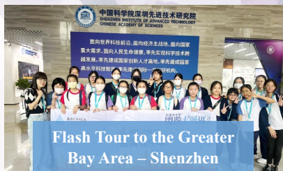
Flash Tour to the Greater Bay Area – Shenzhen