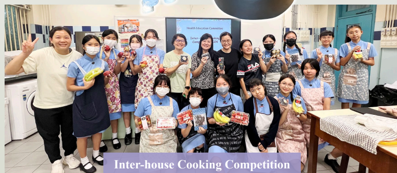
Inter-house Cooking Competition