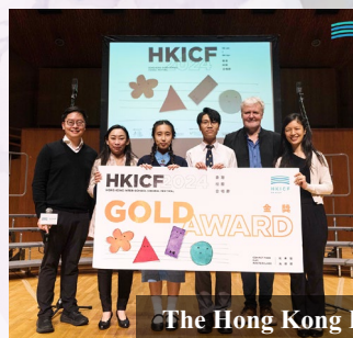
The Hong Kong Inter-School Choral Festival