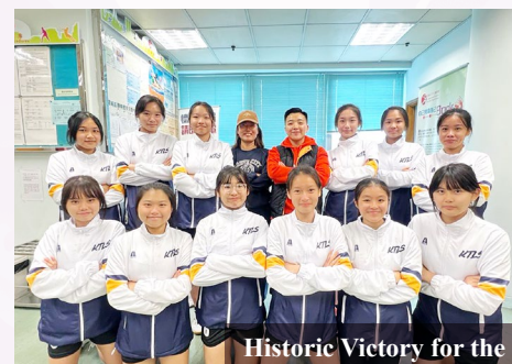
Historic Victory for the School Volleyball Team