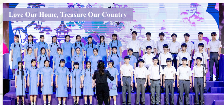
Love Our Home, Treasure Our Country

Festive occasions are celebrated with activities that foster school spirit. Games Day and Christmas celebrations brought joy through competitions, a worship service, and lively class parties. The "Jesus: The Story" Gospel Drama introduced Christian teachings, while the Taekwondo Experience and choir performance at a national education gala enriched students' physical, mental, and artistic development.