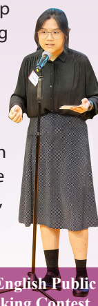
CIE English Public Speaking Contest

Our students are blessed with voices that resonated with eloquence and conviction in the realm of debate and public speaking. They navigated complex arguments and articulated their thoughts with precision, clinching the championship in the Hong Kong Inter-school Debating Competition. Their rhetorical prowess was further showcased as they secured top honors in the Inter-school Public Speaking Contest, where their words echoed with clarity and purpose. In the Hong Kong Speech Festival, their oratory skills earned them several accolades, including multiple first-place awards.