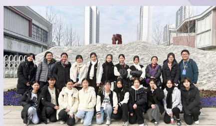
Jiangsu-Hong Kong Friendly Exchange