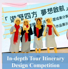
In-depth Tour Itinerary Design Competition