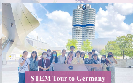
STEM Tour to Germany