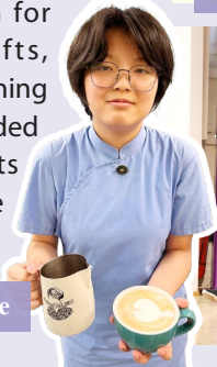
Latte Art Course