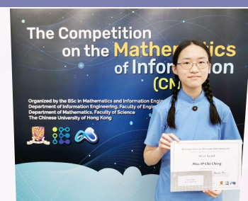
Silver Award in the Competition on the Mathematics of Information