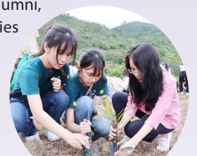
Tree Planting and Hiking in celebration of the 75 th Anniversary