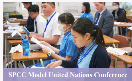
SPCC Model United Nations Conference