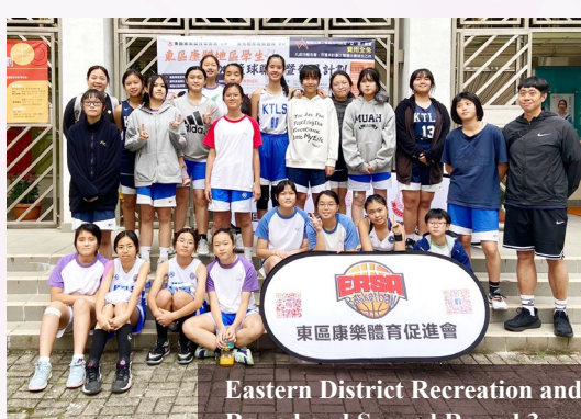
Eastern District Recreation and Sports Association First Round and Second Round 3 on 3 basketball competition