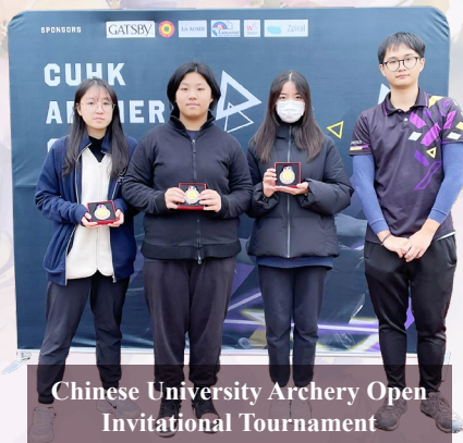
Chinese University Archery Open Invitational Tournament

Sports have always been a strong suit at our school, where the spirit of competition is woven into the very fabric the True Light Spirit. Our athletes demonstrated exceptional skill and perseverance across various disciplines, winning the championship in the CCC 3-on-3 basketball tournament and earning commendable placements in the Eastern District Recreation and Sports Association's basketball competition, including championship titles in the U14 and U16 categories. In the realm of archery, our students hit the mark at the K S Lo Cup Secondary Schools Archery Invitational Tournament, securing multiple championships and top placements. The volleyball team soared to 1st runner-up in the CCC Inter-school Volleyball Competition, while the basketball team claimed top positions in the Kowloon District Basketball Division 1 Competition. Additionally, our girls' team excelled in the Inter-school Physical Fitness Challenge, proudly clinching the champion title.