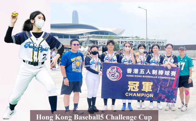
Hong Kong Baseball5 Challenge Cup