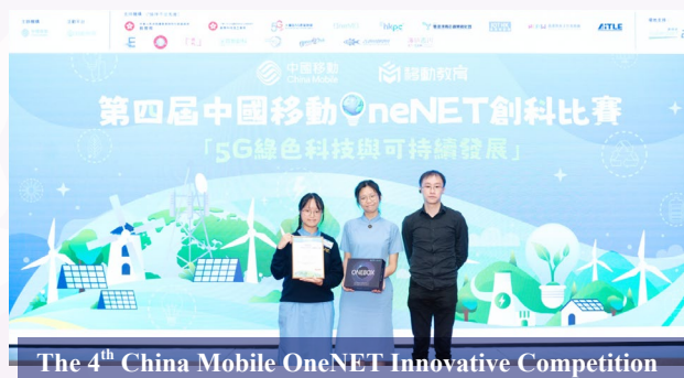
The 4 th China Mobile OneNET Innovative Competition