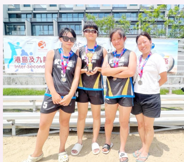
BOCHK Beach Volleyball Cup