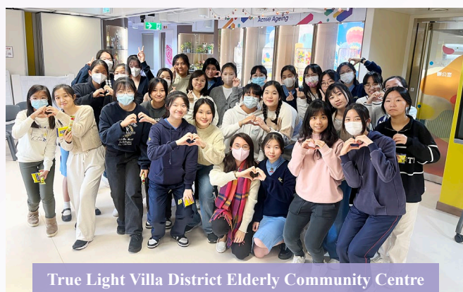
True Light Villa District Elderly Community Centre