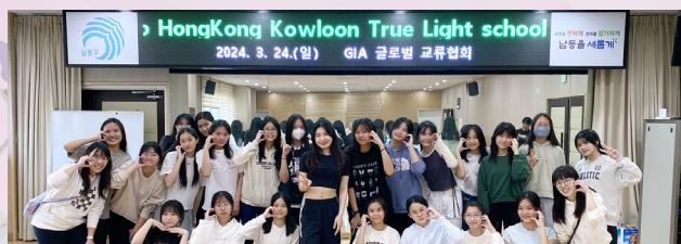
Seoul Religious and Performing Arts Cultural Study Tour