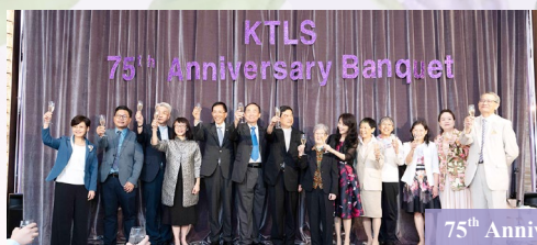
KTLS 75 th Anniversary Banquet