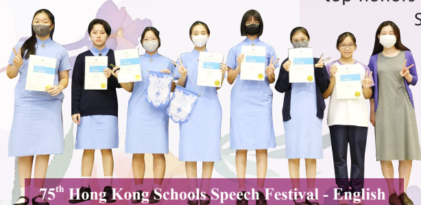
75 th Hong Kong Schools Speech Festival - English