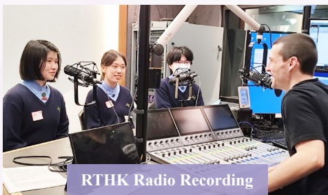
RTHK Radio Recording