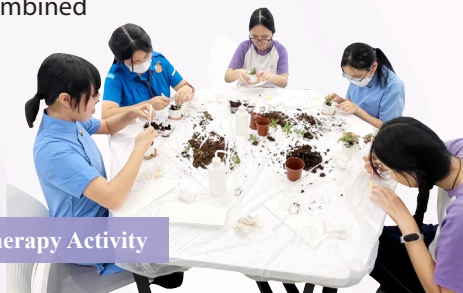
Horticultural Therapy Activity

Our school also encourages students to contribute positively to society through community and environmental initiatives. The Tree Planting and Hiking event celebrated our 75 th anniversary, while the Snorkelling and Beach Cleaning event reinforced environmental awareness. The Horticultural Therapy Activity promoted well-being through creative crafts, and Dress Casual Day combined cultural celebration with charity, raising funds and creating a festive atmosphere.