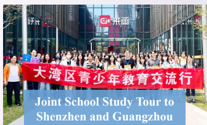
Joint School Study Tour to Shenzhen and Guangzhou