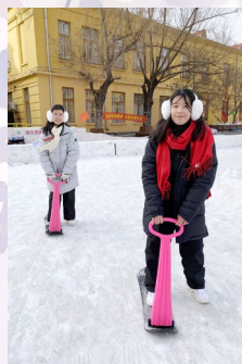
Ice Sparkles - Harbin Sister School Exchange Trip