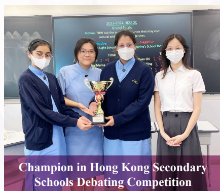
Champion in Hong Kong Secondary Schools Debating Competition