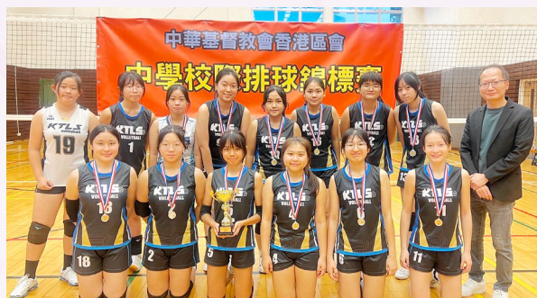
CCC Inter-school Volleyball Competition