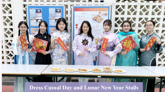
Dress Casual Day and Lunar New Year Stalls