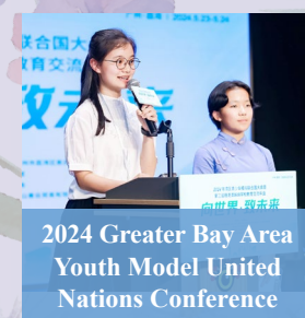
2024 Greater Bay Area Youth Model United Nations Conference