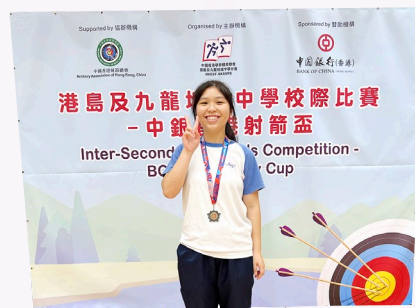
The BOC Hong Kong Archery Cup Competition