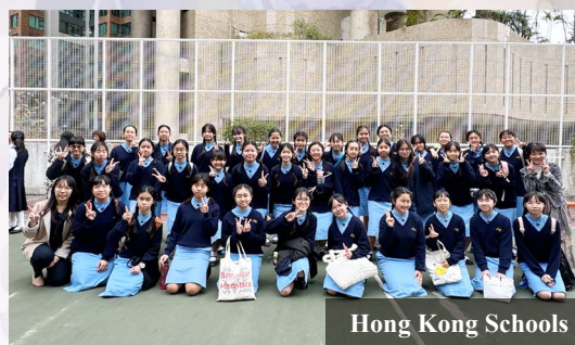
Hong Kong Schools Music Festival

At our school, where the arts are nurtured with the same care as the mind, the musical and artistic talents bring color and a sense of pride to all of us. The school choir achieved notable success this year, winning a gold prize in the Senior Division of the Hong Kong Inter-School Choral Festival through a collaboration with Sing Yin Secondary School Choir, and another gold prize in the Junior Division of the Hong Kong Schools Music Festival. In speech and storytelling, students excelled in the 75 th Hong Kong Schools Speech Festival with 2 first prizes, and also reached the finals in the 2nd GBA-HK-Macau "Kids Voice" Cup Speech & Storytelling Competition, with one student earning First Runner-up in the Cantonese Category, alongside a finalist in the HKBU CIE English Public Speaking Contest.