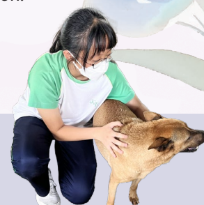
Big Tree Pet Care Service Learning