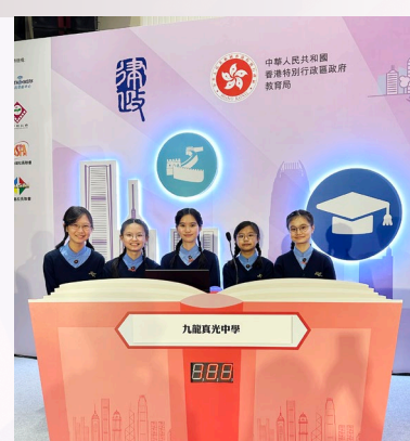
The Territory-wide Inter-school National Security Knowledge Challenge