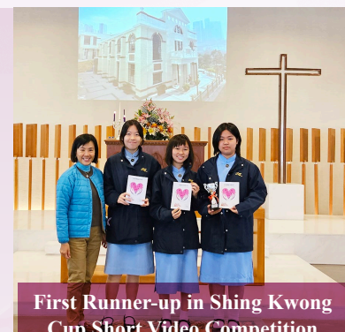
First Runner-up in Shing Kwong Cup Short Video Competition