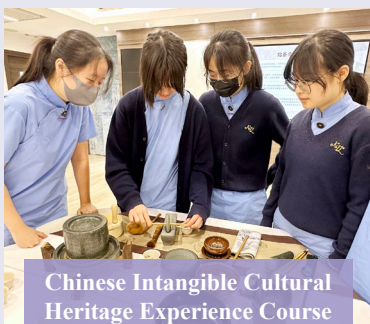
Chinese Intangible Cultural Heritage Experience Course