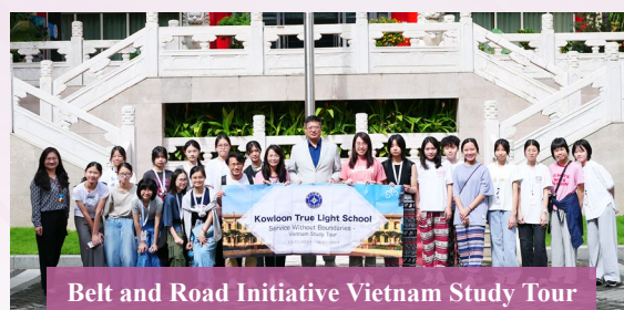
Belt and Road Initiative Vietnam Study Tour