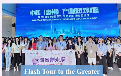
Flash Tour to the Greater Bay Area – Zhuhai