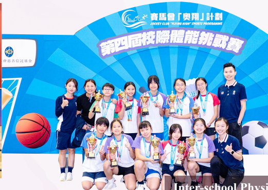
Inter-school Physical Fitness Challenge