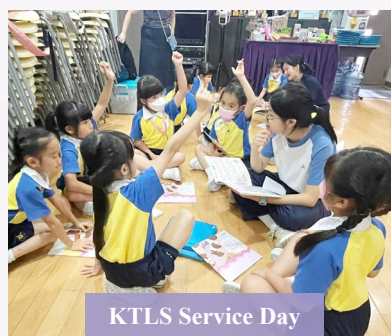
KTLS Service Day

Our dedication and spirits extend to educational outreach and leadership development. During the KTLS Service Day, students stepped into the role of teachers, sparking curiosity and creativity in younger peers while refining their own communication and leadership skills. The Joint School Leadership Training Camp offered another avenue for personal development, where students from three schools collaborated, building confidence and resilience. Each of these activities not only enriches the lives of those served but also instills in our students the values of responsibility, empathy, and the power of education.