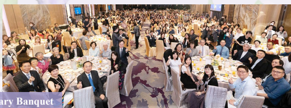
75 th Anniversary Banquet