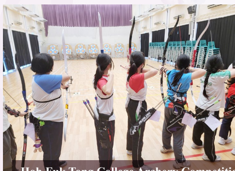
Hoh Fuk Tong College Archery Competition