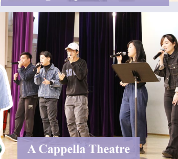
A Cappella Theatre