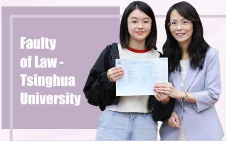
Faculty of Law - Tsinghua University