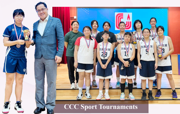
CCC Sport Tournaments