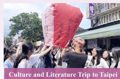
Culture and Literature Trip to Taipei