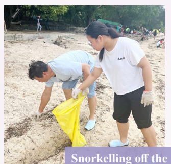
Snorkelling off the coast of Sharp Island