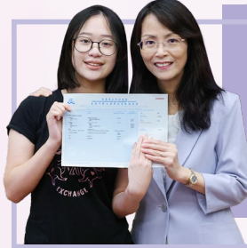
Bachelor of Medicine & Bachelor of Surgery - HKU