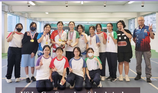
KS Lo Cup Secondary Schools Archery Invitational Tournament