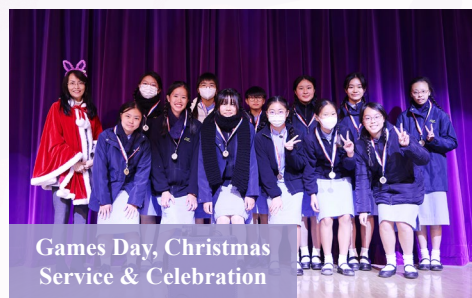
Games Day, Christmas Service & Celebration