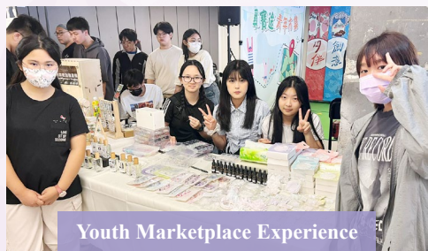
Youth Marketplace Experience