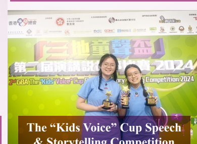
The "Kids Voice" Cup Speech & Storytelling Competition