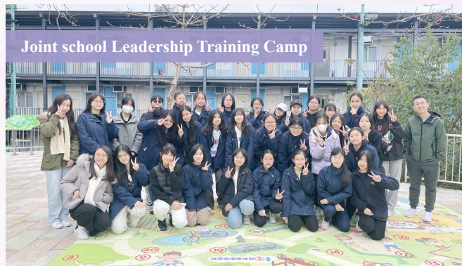
Joint school Leadership Training Camp