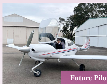
Future Pilot Program 2024