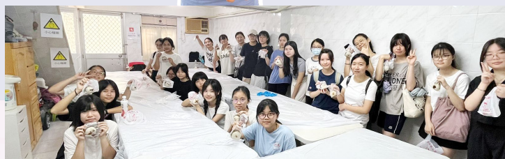
Tai O Fishing Village Cultural Experience